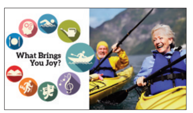
The new Welcome Center plays off a marketing campaign introduced in June, showcasing the active Overlook lifestyle.

This fall marked the opening of a brand new Welcome Center at the Overlook. The team used an existing resi-