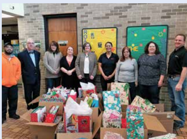
Charles W. Moore Lodge partnered with Avery Dennison Corporation to provide over 100 Christmas gifts to dozens of children at the Reingold Elementary School in Fitchburg, MA.