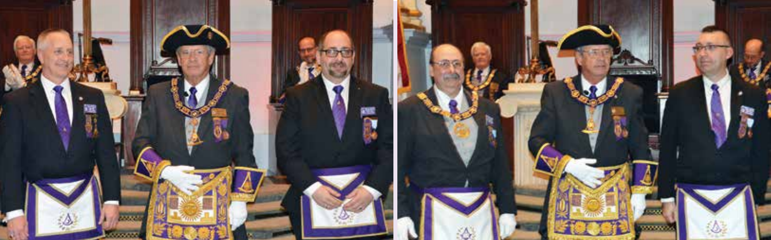
“All four of you represented Freemasonry well in your travels these last three months, and I think our Lodges are all better from having enjoyed your company,” the Grand Master said to the candidates.