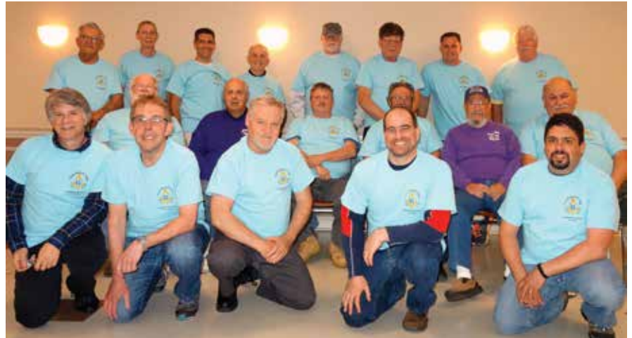
The Brothers of United Brethren who make the Car Show possible