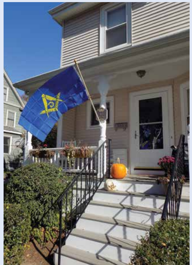
In October members of Pequossette Lodge flew masonic flags at their homes in support of the open house.