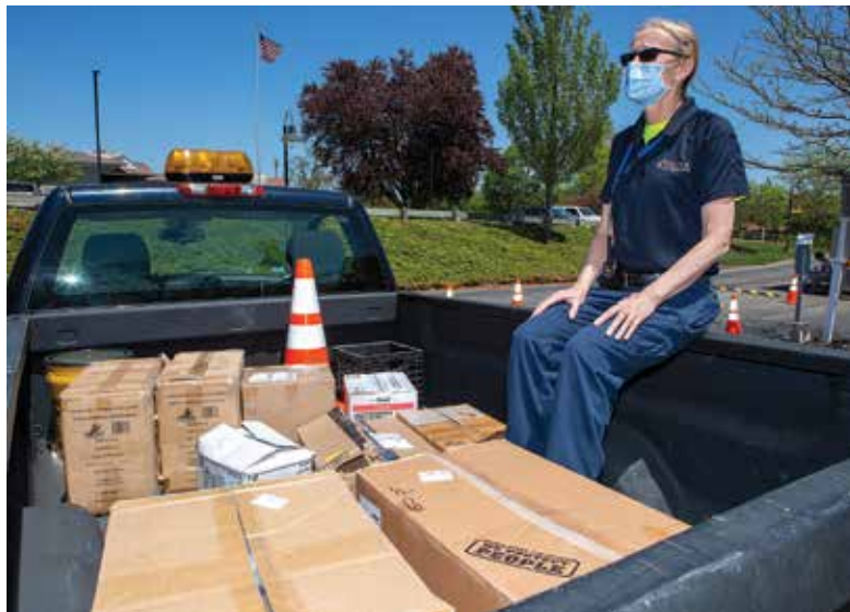
A masked member of staff at Charlton with that week's haul of necessary equipment to ensure the safety of residents and staff.