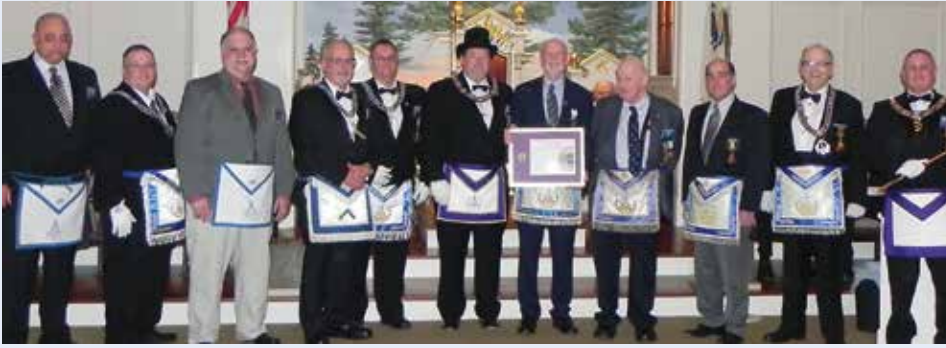
The members of Palestine Lodge