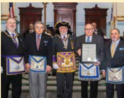
William Parkman Lodge, 13th District