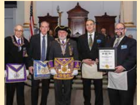
Pequossette Lodge, 3rd District