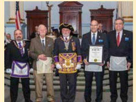
Orient Lodge, 6th District