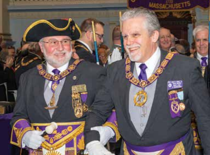
The Grand Master and Grand Marshal enjoy their entrance into the Lodge room.