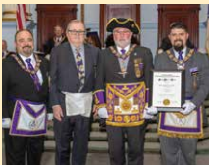
Union Lodge, 6th District