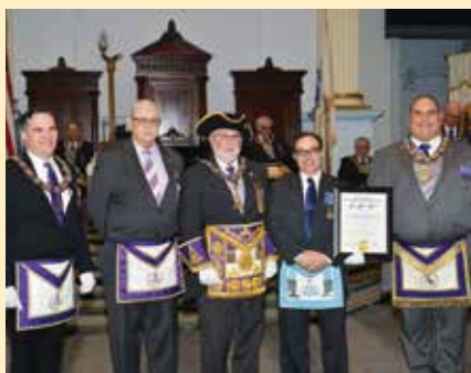
The Meadows Lodge, 28th District