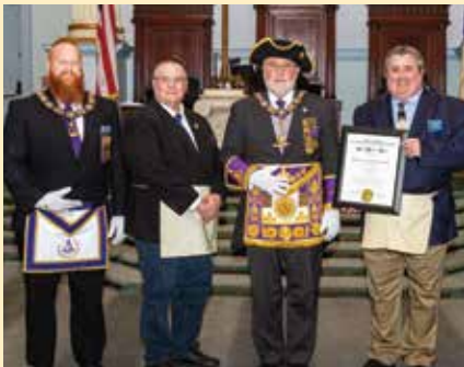
William Sutton Lodge, 4th District