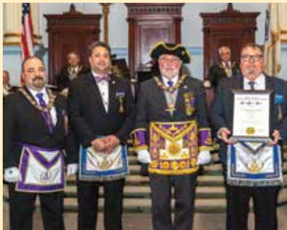
Celestial Lodge, 6th District