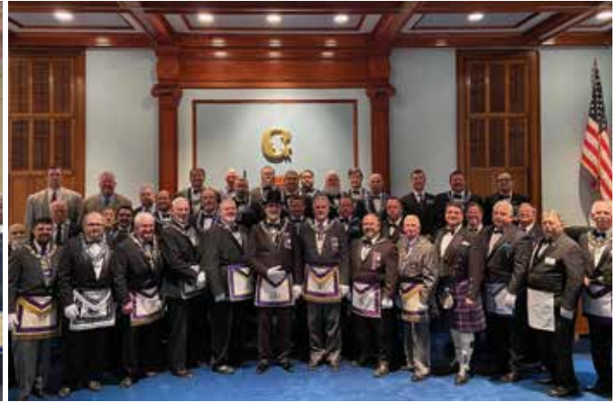
The Union of the Unions in Dorchester (L) and on Nantucket (R).