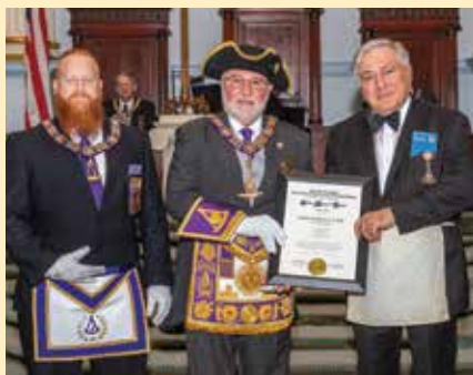
Converse Lodge, 4th District

After a standing ovation, the Grand Master closed the Quarterly in ample form. ■