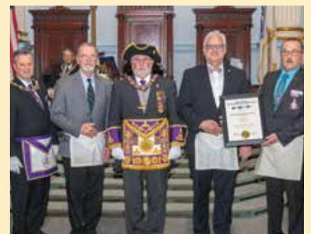
Daniel Webster Lodge, 18th District