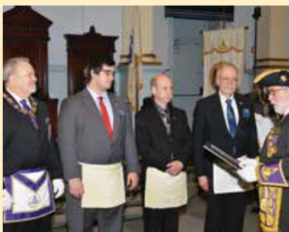
Corinthian Lodge, 14th District