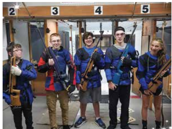
Members of the South Coastal Youth Rifle Team